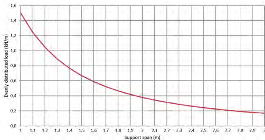
Permissible load KP 60/100 d=0,6mm (kN/m)